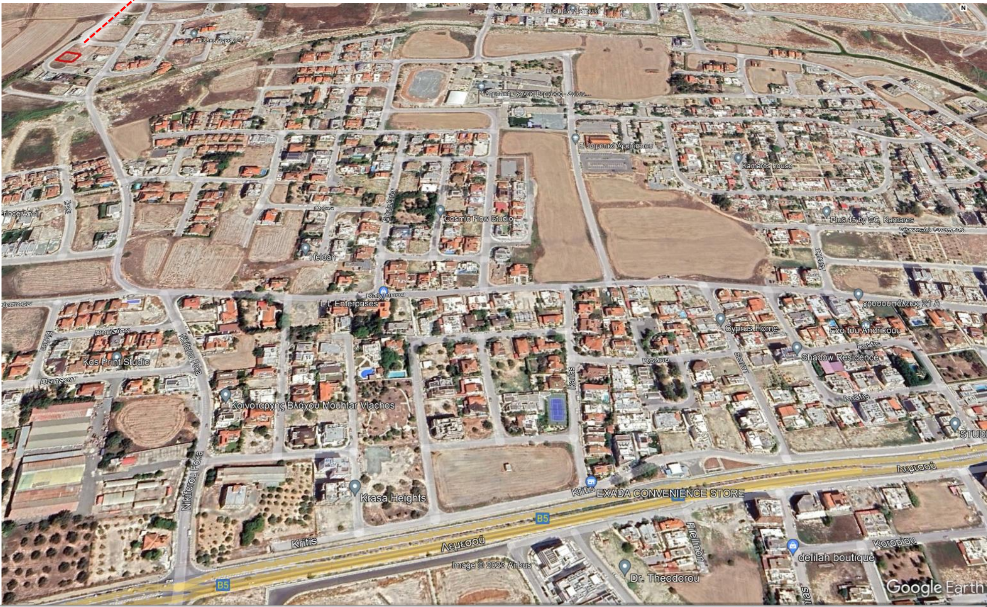
IDEAL LIVING 7 RESIDENCE - LOCATION